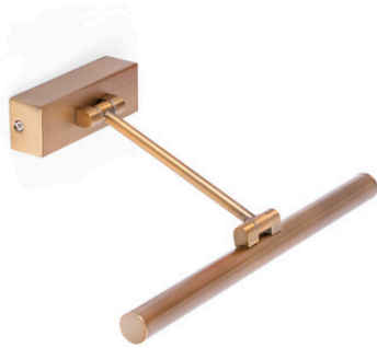
Old Gold FA61084