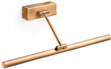
Old Gold FA61084